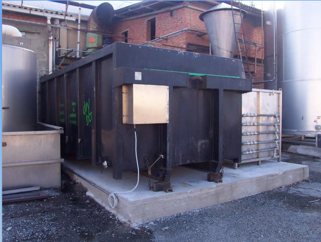
Treatment facility for printing water