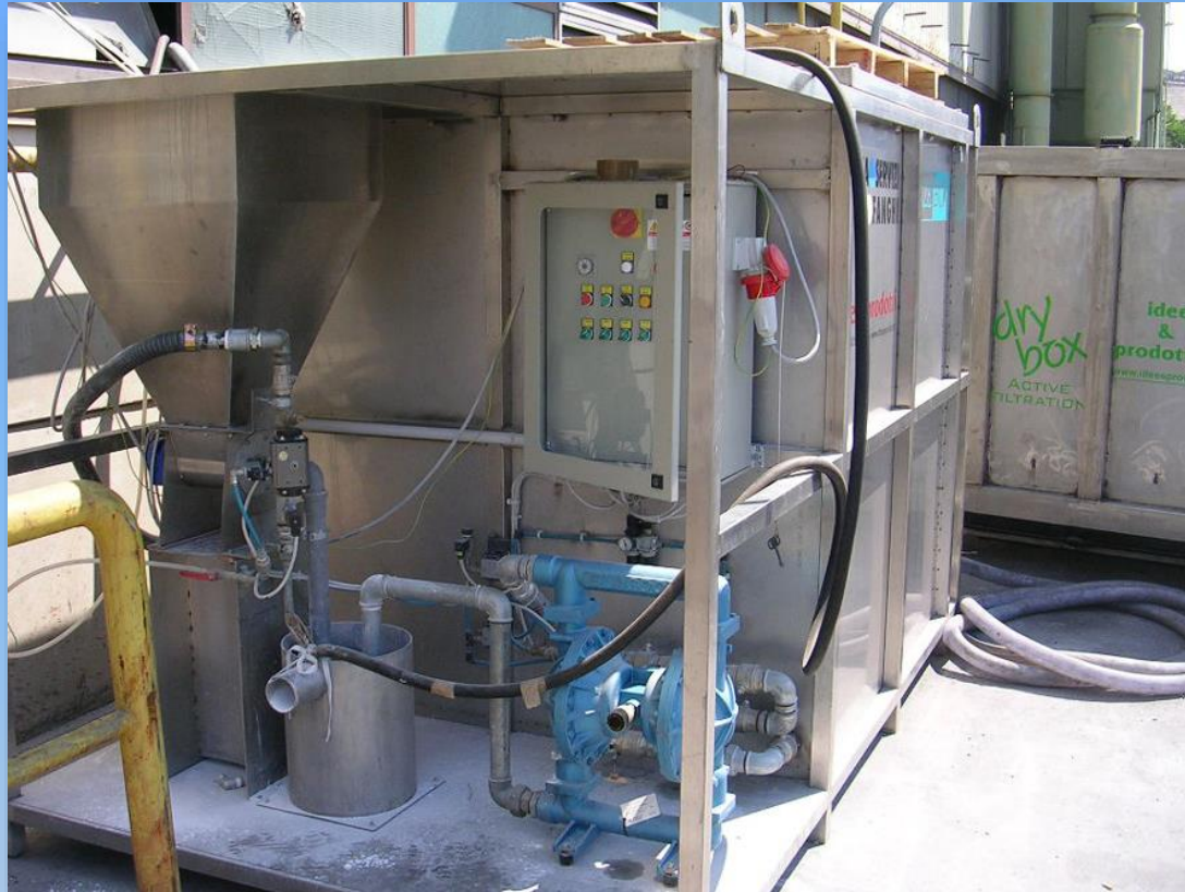
Treatment from paint booth