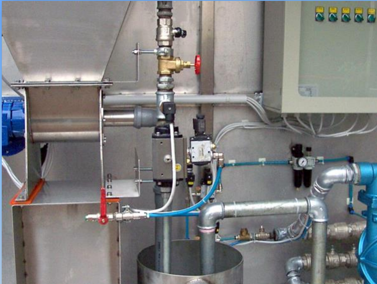
Treatment facility detail